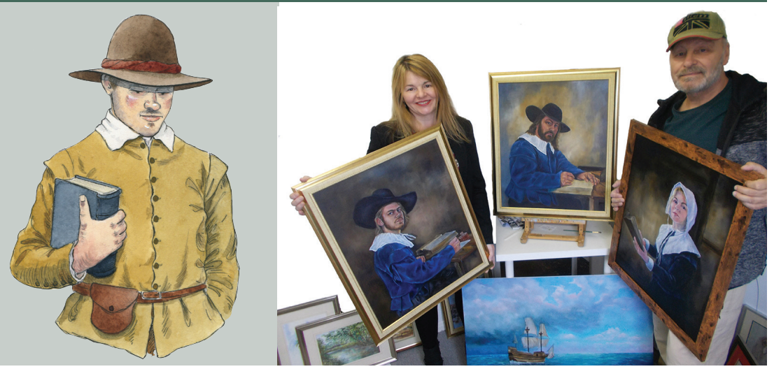
From Babworth to the New World – local artist working on a new Pilgrim Exhibition