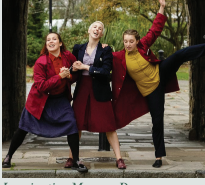
Imagination Museum Dancers