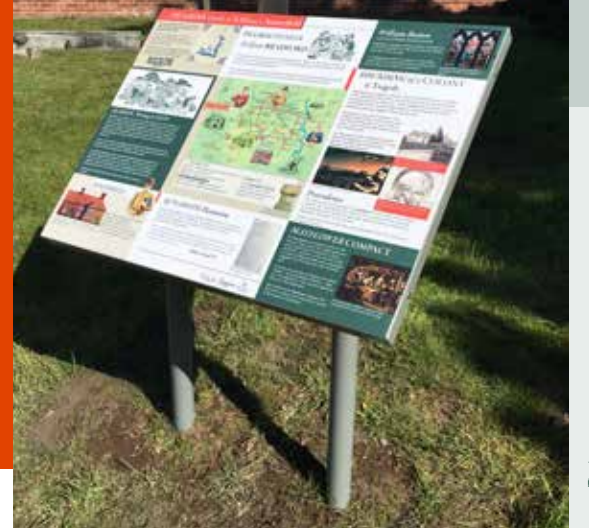
One of the panels - St Helena's Church, Austerfield