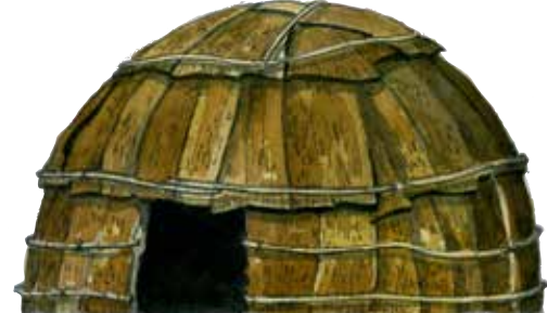
A Wampanoag Wetu