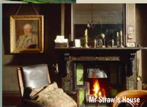
Mr Straw's House