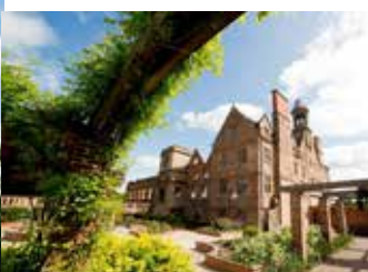
Rufford Abbey Country Park