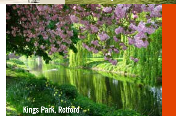
Kings Park, Retford