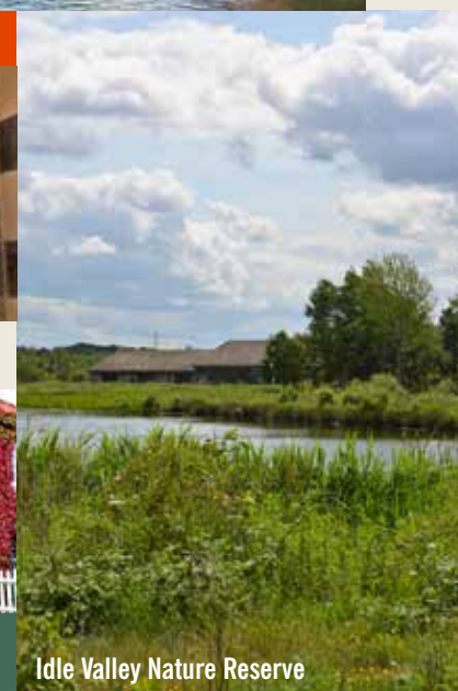
Idle Valley Nature Reserve

While visiting the Pilgrims Gallery, take a tour of the rest of Bassetlaw Museum: set in the beautiful Georgian Amcott House, the Museum boasts a rural heritage centre, archaeology room and costume display, as well as temporary exhibitions.