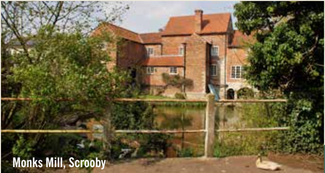
Monks Mill, Scrooby

There are two interpretation boards in Scrooby, located next to St Wilfrid's Church and another outside the Village Hall. Both buildings are well worth visiting to learn more about William Brewster and his fellow Mayflower passenger, Susanna White Winslow. Look out for the Pilgrim 400 apple tree opposite the Village Hall, grown especially to commemorate the 400th anniversary of the Mayflower journey, Scrooby was the first village to be chosen for these trees to be planted. They are also to be found in the other Mayflower 400 partner destinations. The international signs outside the village pub are a great photo opportunity.