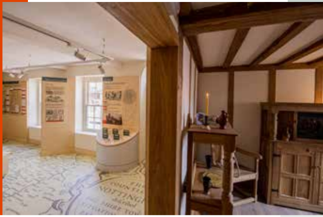
The Pilgrims Gallery