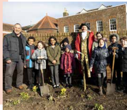
The planting at Southampton

Coming up for the opening of the summer PilgrimAGE season of events, 'Flight of the Separatists' is a day-long event on Sunday 10 May in Gainsborough to mark the historic date that the Separatists escaped via the River Trent to make their way to Holland. The Old Hall will be the centre of activities, with music and fun throughout the day. The event will also feature Gainsborough's mass participation Make a Mayflower project to mark the anniversary. A range of making-options are available (in wool, paper, card and even milk bottles) we'd love you to have a go and be part of Gainsborough's community Mayflower event.