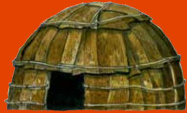
A Wampanoag Wetu