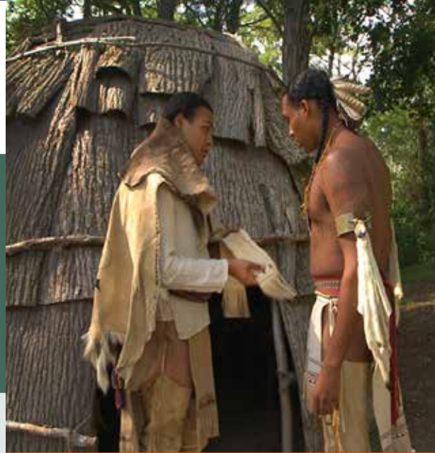
Wampanoag people at Plimoth Plantation, Massachusetts