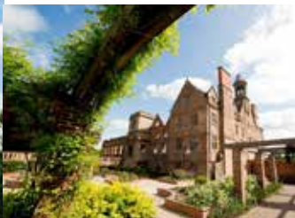
Rufford Abbey Country Park