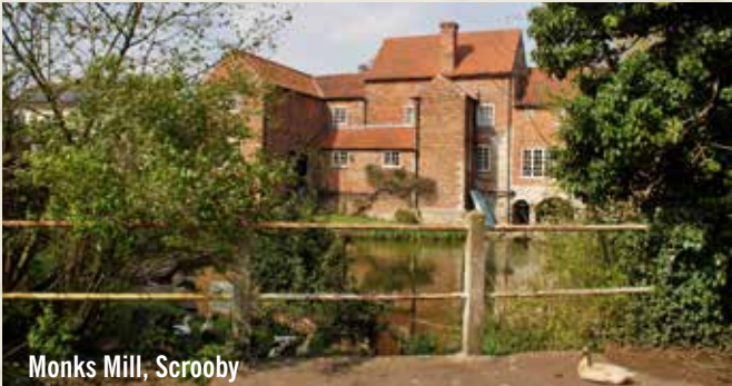
Monks Mill, Scrooby

There are two interpretation boards in Scrooby, located next to St Wilfrid's Church and another outside the Village Hall. Both buildings are well worth visiting to learn more about William Brewster and his fellow Mayflower passenger, Susanna White Winslow. Look out for the Pilgrim 400 apple tree opposite the Village Hall, grown especially to commemorate the 400th anniversary of the Mayflower journey, Scrooby was the first village to be chosen for these trees to be planted. They are also to be found in the other Mayflower 400 partner destinations. The international signs outside the village pub are a great photo opportunity.