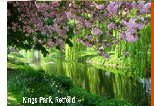
Kings Park, Retford