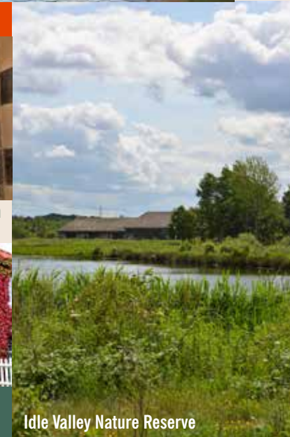
Idle Valley Nature Reserve

While visiting the Pilgrims Gallery, take a tour of the rest of Bassetlaw Museum: set in the beautiful Georgian Amcott House, the museum boasts a rural heritage centre, archaeology room and costume displays as well as temporary exhibitions. You could also enjoy a stroll through the beautiful garden and see the commemorative Pilgrim 400 apple tree.